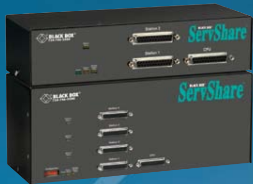
Top: KV752A; bottom: KV754A